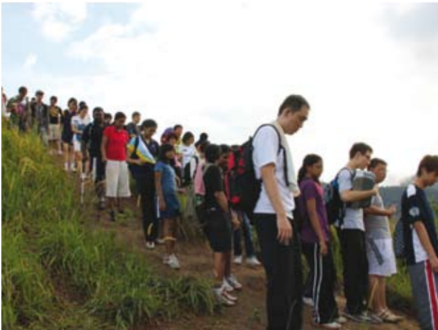
Queuing to descend