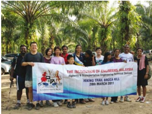
Group photo at the car park

before us amidst low lying mist while sipping hot cups of coffee. The peaceful quiet serenity made it all worthwhile to sacrifice a Sunday morning sleep-in. It was unfortunate that thick clouds had covered the hills, so the sunrise was not that spectacular. Nevertheless, it was still an amazing view to behold irrespective of the number of times that one has been there.