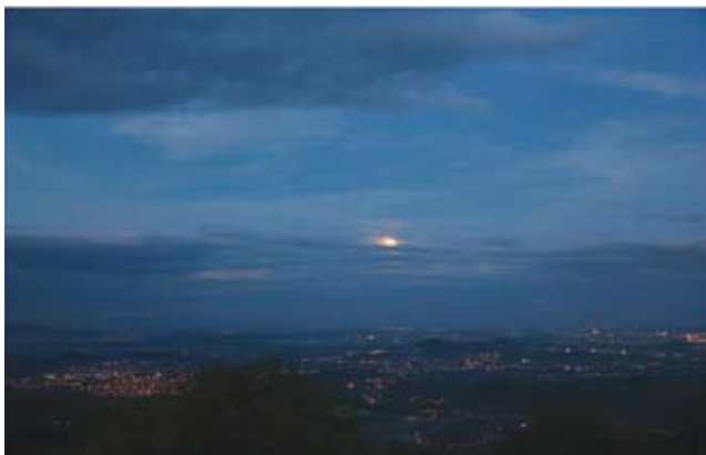
Moon light over Kajang town