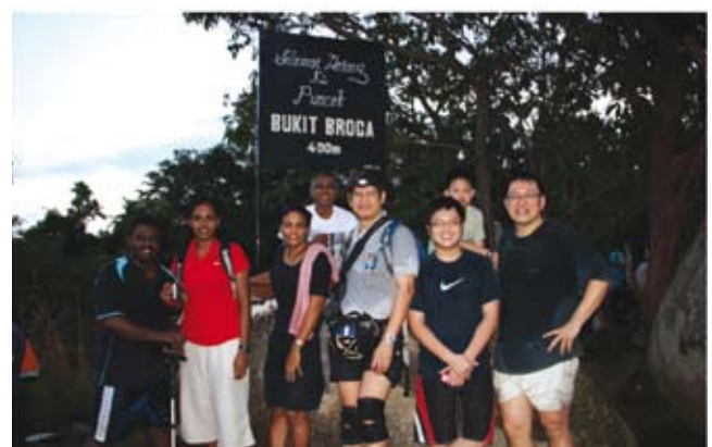
Members that reached the peak