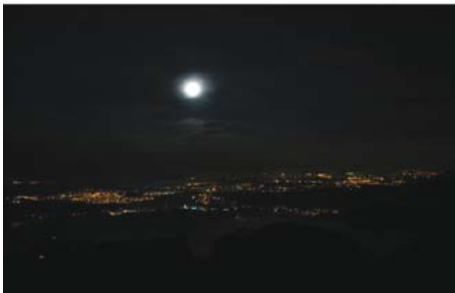
Super Moon light over Kajang town

The trail leading towards the peak of Broga Hill was rather gentle passing through very tall 'lalang', some taller than the average man's height. The crowd dwindled down as we approached the peak. Finally, we reached the peak after climbing over a steep rock face. A large signboard next to a rock welcomed and informed us that we have reached the peak at 400m. We soaked up the beautiful scenery